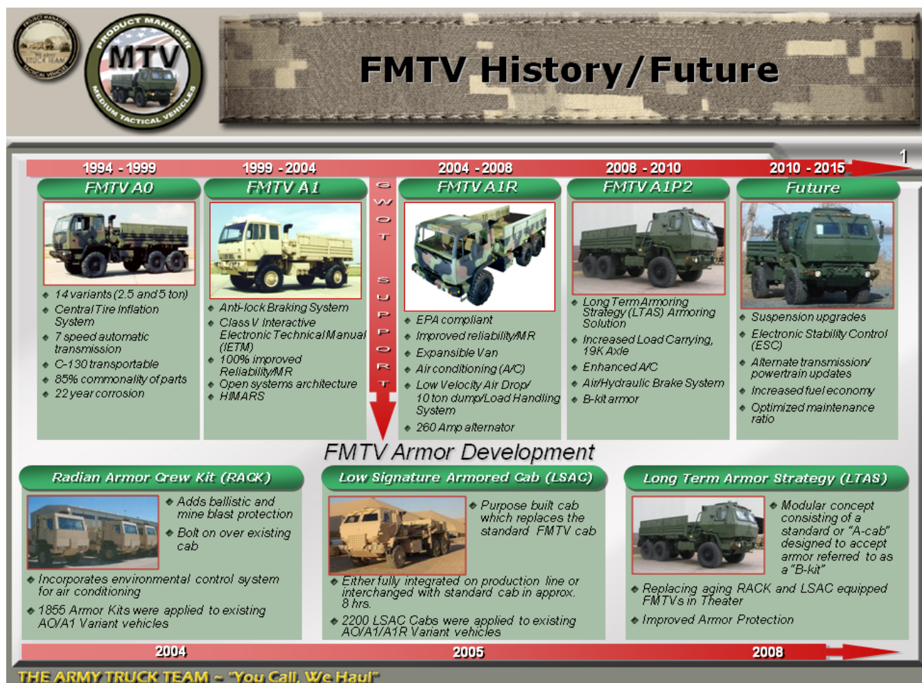
Figure 2. (FMTV Evolution)

Armor solutions and the trucks that they reside on have continued to evolve based on lessons learned from combat. In addition, the 23 June 2005 Joint Requirements Oversight Council Memorandum (JROCM) mandated that all manned vehicles from hence forth would have force protection and survivability Key Performance Parameters (KPPs). Figure 2 shows the evolution of the Family of Medium Tactical Vehicles (FMTVs) for both the truck and armor.